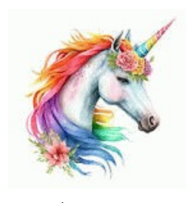
National Unicorn Day April 9